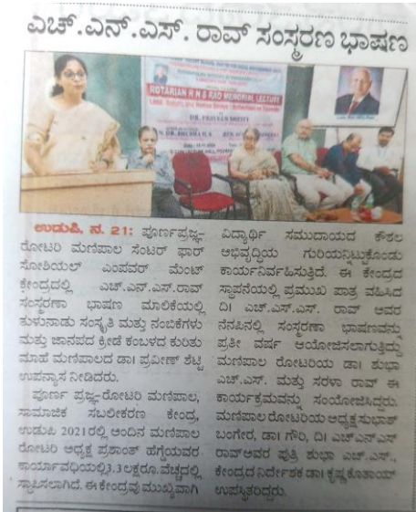
Udayavani Newspaper dt 22.11.2014